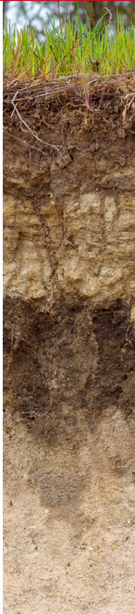
Figure 1: Soils types across Australia