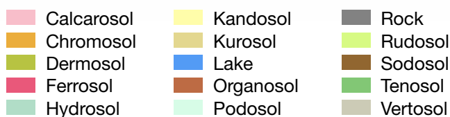
Figure 1: Soils types across Australia