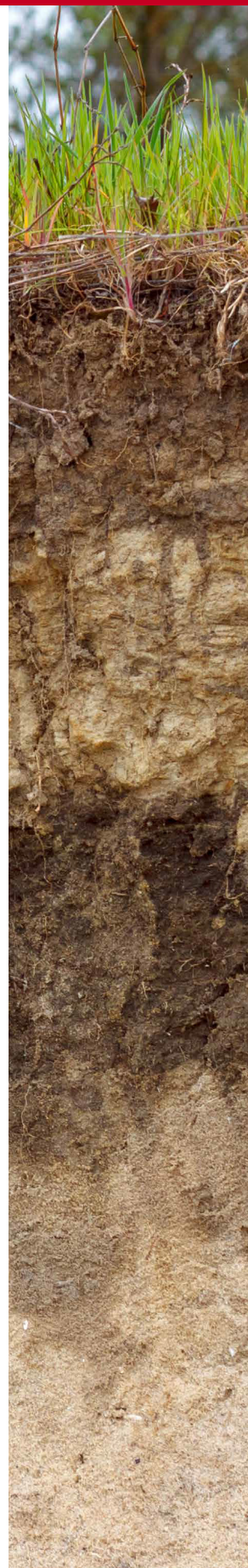
Figure 1: Soils types across Australia